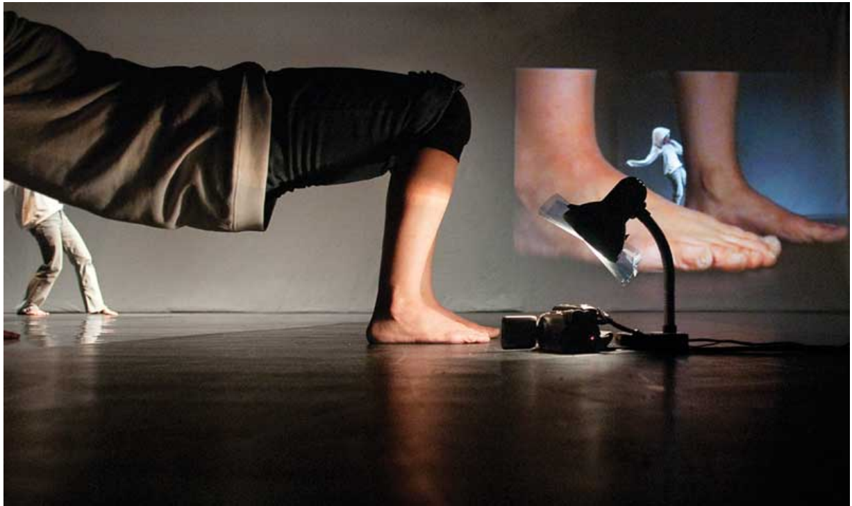
Miniatura. Mov[i]Ment #1. Festival Grec (2010).