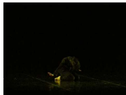
the Lizard's skin